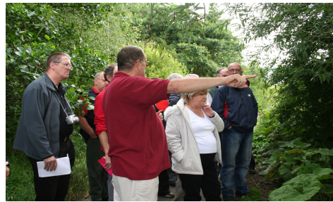
Figure3: Scrutiny Members on a site visit