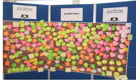
Figure2: Scrutiny Consultation Exercise